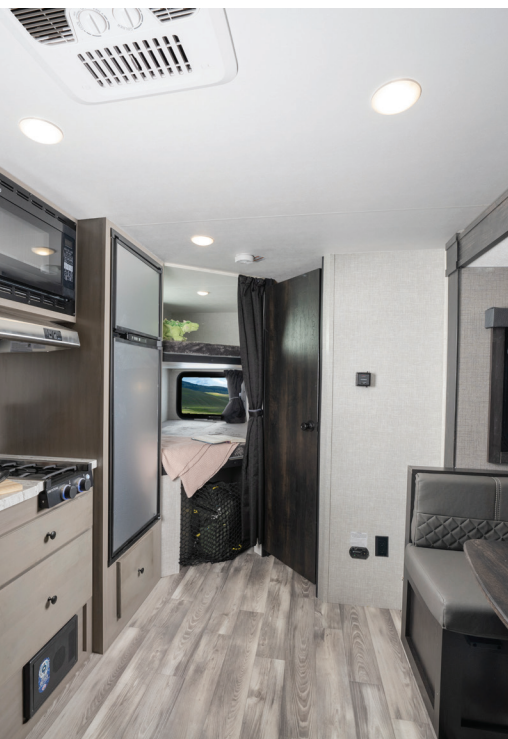
2023 Super Lite Maxx 19MBH