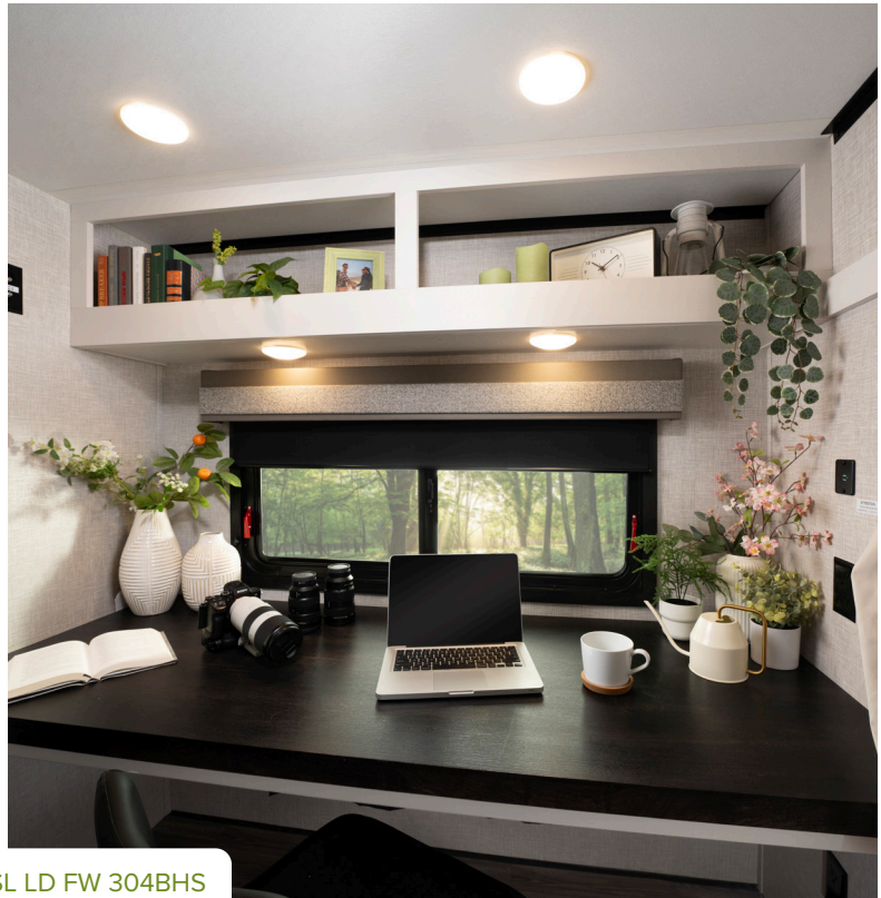
2025 Starcraft GSL LD FW 304BHS